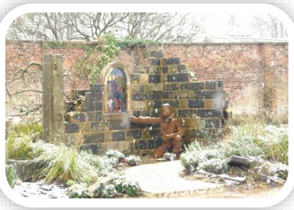
taken 4 March in snow

The event, which is being run by Chorley Council in the beautiful setting of