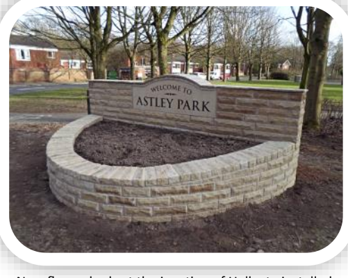
New flower beds at the junction of Hallgate installed through the Neighbourhood Working projects group, Chorley Council working together with Astley Village

New stone planters have been installed at the entrance to Hallgate Neighbourhood as а Working project with Chorley Council. Following all the work that has been done to improve Astley Park it seemed a good idea to improve the entrance to the park through the busy Hallgate car park. It also provided the opportunity enhance our village centre. Hopefully by the time you read this the planters will have been filled too.